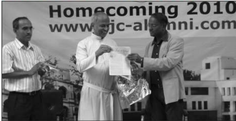
Release of the Alumni newsletter

They may have probably run around trees together, had common tea breaks, practiced dance steps, or perhaps, discussed about their future with each other at some point when they were on the campus in their yesteryears.