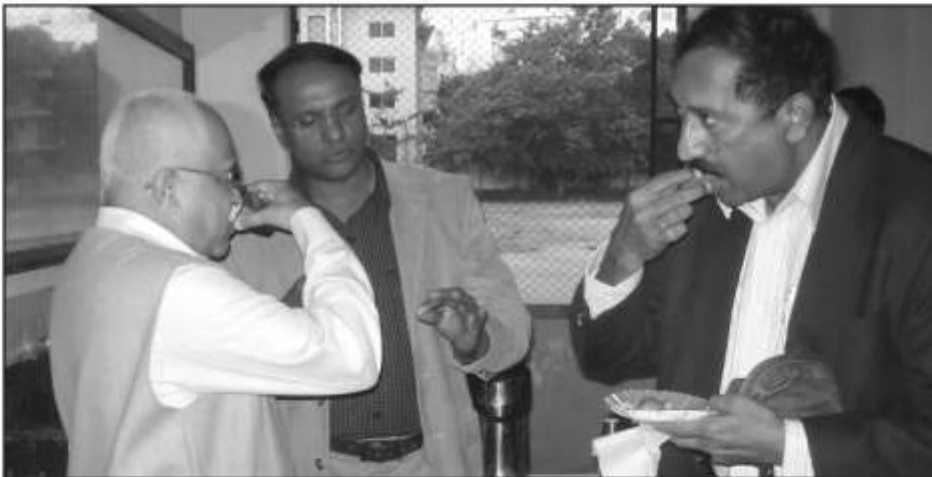
Members expressed satisfaction that they had a good interaction with the Principal