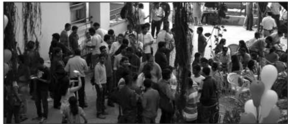
Over 300 alumni members were present for the re-union

and cherishing their glorious moments in the College. Some of them were